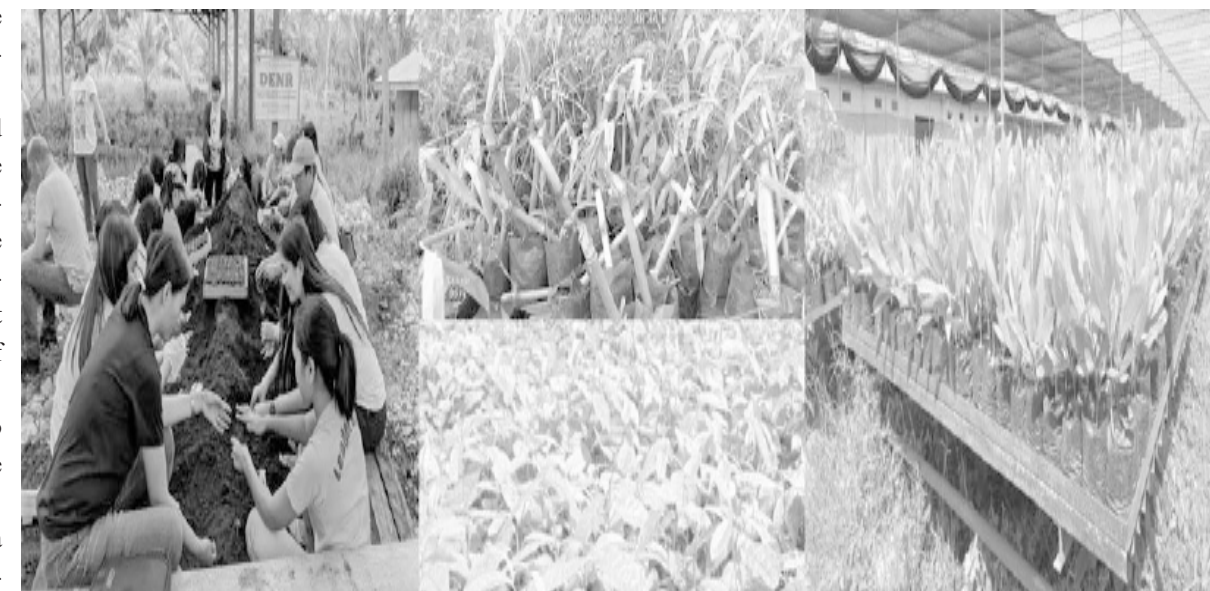
Left photo shows DENR workers in Lianga, Surigao del Sur preparing potting materials for seedlings production under the Enhanced National Greening Program (ENGP), which as of July 9 has prepared some 36 million seedlings or 80% of its 2020 target of 45.2 million. Middle photo shows bamboo and cacao seedlings for agroforestry and watershed areas, while right photo shows acacia manguim seedlings - all are ready for planting in ENGP tree plantation sites. Source: DENR

(From page 3) est tree seedlings for planting under the ENGP. The vegetable seedling production is the Laban sa COVID-19" program, which promotes urban agriculture amid the pandemic. Source: DENR